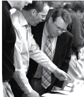
Auction Guests deciding what to bid on.