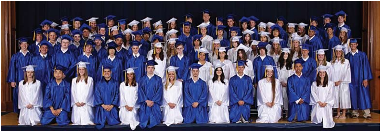
ECHS Class of 2007