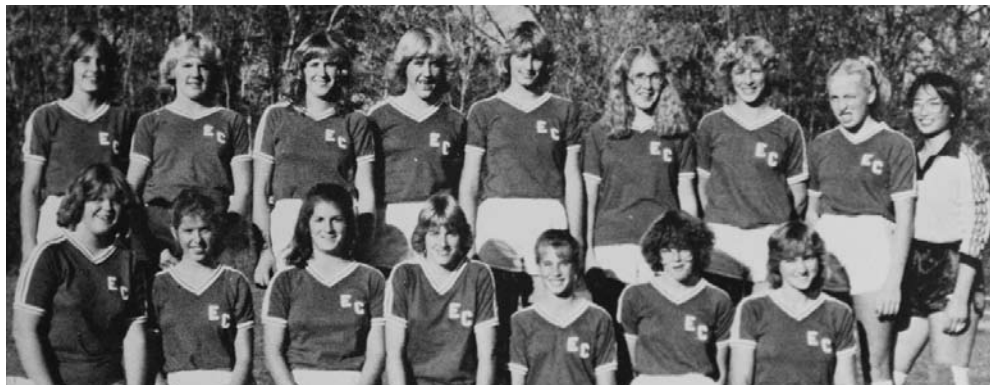
Varsity Girls Soccer Team of 1982