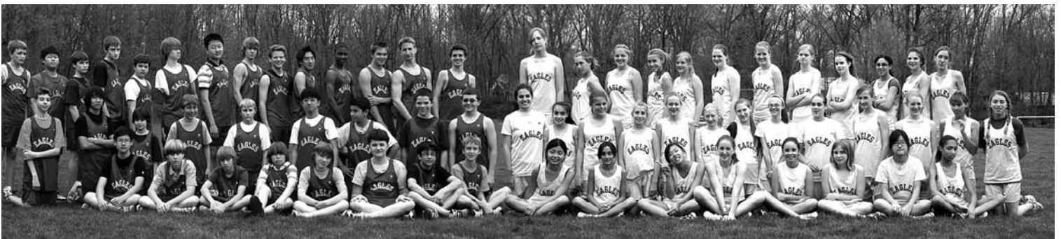
ECMS Boys and Girls Track Team