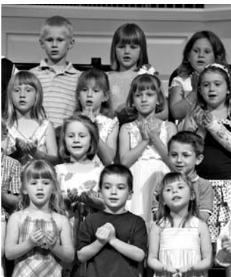
EC Preschool students singing their favorite songs.

The Eastern Christian Preschool Class of 2007 held their graduation and closing program on Monday, June 11 at Cedar Hill Christian Reformed Church in Wyckoff. The children presented a program based on this year's theme of Faith. A highlight was singing the hymn "Great is thy Faithfulness" which was so evident as the children sang to a few generations of their families. As these families look forward to more graduations in the future, God's faithfulness will certainly continue.