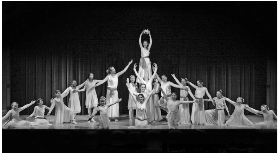
The ECMS Spirit Team was the opening act at the Jonas Brothers Concert in March 2007.