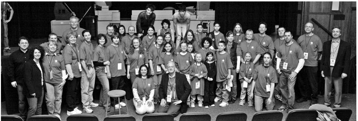
Eastern Christian Marketing Committee hosted a concert by the well-known Jonas Brothers, who are former EC students. Shown, along with the Jonas Brothers (top row, center), are all the volunteers who contributed the success of the evening!