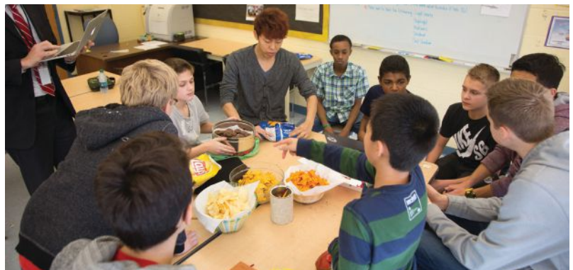
On Tuesday afternoons, middle school students lead peers in a small group setting.