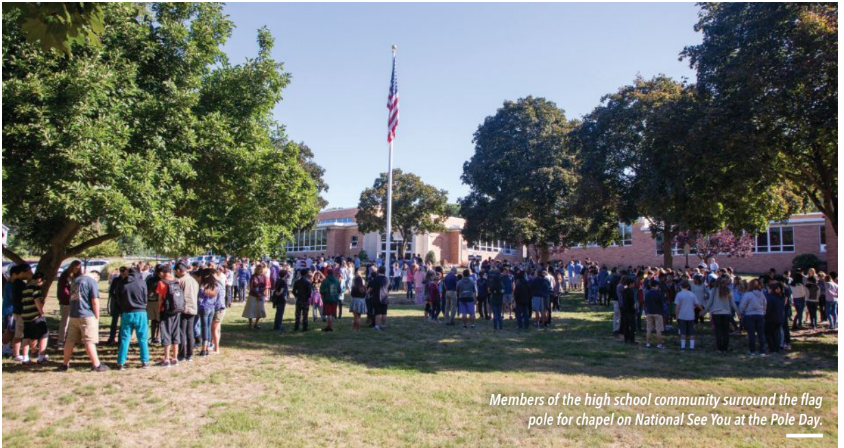
Members of the high school community surround the flag pole for chapel on National See You at the Pole Day.