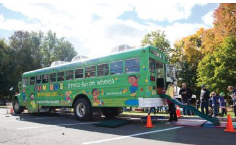
PAGE 3 Touch A Truck Fun Bus