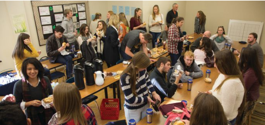
The Foundation for Eastern Christian School hosted a continental breakfast for recent graduates immediately following the chapel.

On Nov. 25, Eastern Christian High School welcomed back many alumni and hosted its first-ever Thanksgiving Alumni Chapel at the high school. Some of these alumni led in worship and spoke to the current students at the high school about the influence EC had on them.