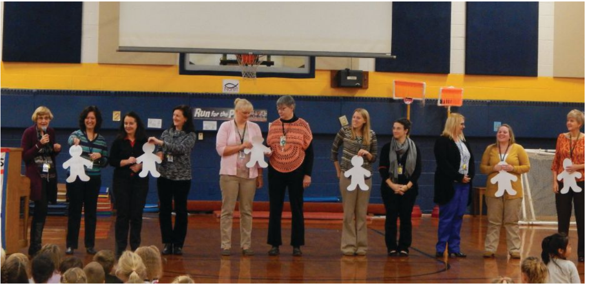
Teachers were called up to the front during the PBL kickoff chapel to reveal each grade's assigned Hebrews 11 person of faith.

On Nov. 10, the elementary school celebrated its PBL kickoff chapel. Standing for Problem Based Learning, the chapel service unveils a school-wide project each year based on real-world contexts, tasks and tools. The goal is to use a question, problem or challenge to build student knowledge and skills over an extended period of time.