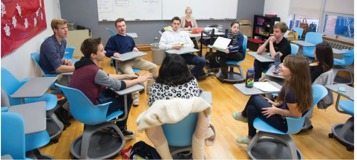
Students use the new space for a small group chapel conversation.

When it came time to renovate rooms 303 and 305, high school administrators opted for a modern makeover. The school's two rooms have bucked the trend of neatly arranged, rigid desks in favor of chairs and desks that spin and move.